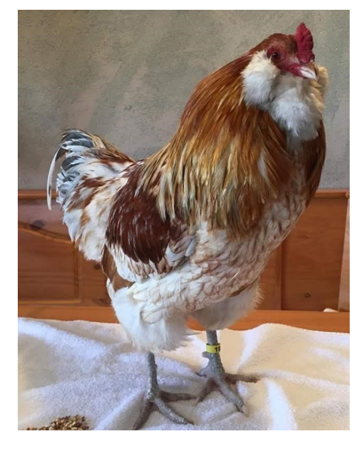
Nugget- young SW Cockerel